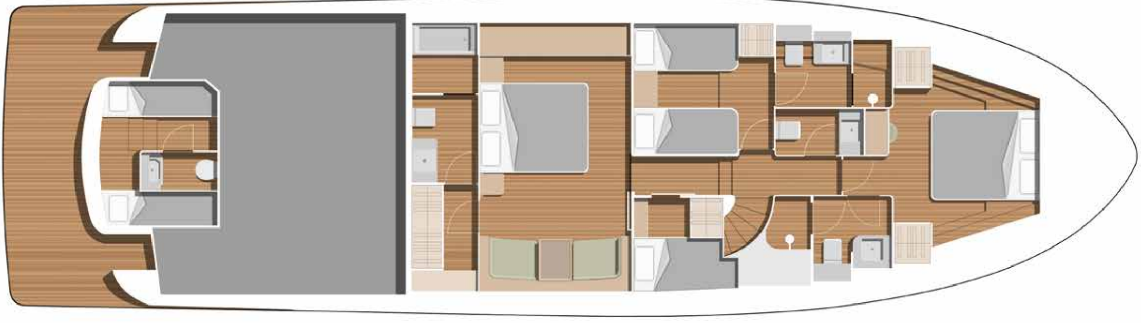
4 CABIN LAYOUT