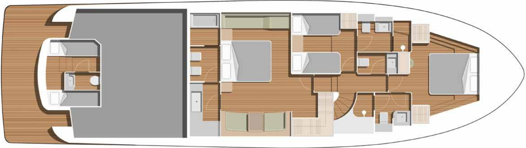
3 CABIN LAYOUT